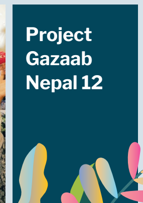
During the 12 th cycle of Project Gazaab Nepal, volunteers journeyed to Nepal's mountains to engage with remote communities and impart business skills to local students.