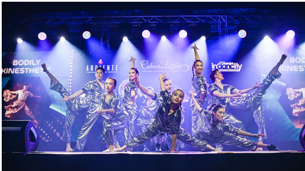
SMU Wushu, SMU Taekwondo, SMU Ardiente, SMU Indancity and SMU Caderas Latinas performing at SMU's Academic Year Opening event in 2023.