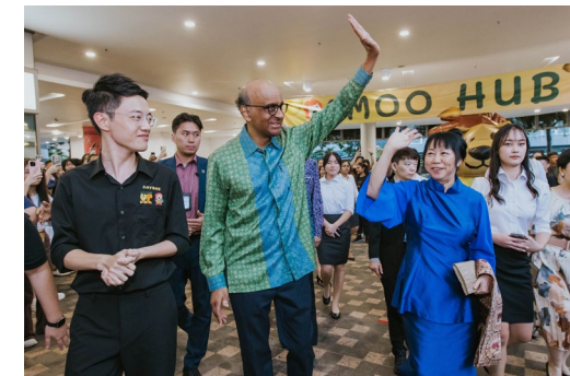
President of Singapore Mr Tharman Shanmugaratnam (centre left) and Ms Jane Ittogi (centre right) at SMU Patron's Day 2024.

The University marked its 24 th anniversary with its biggest SMU Makers' Market, doubling its sustainability efforts and