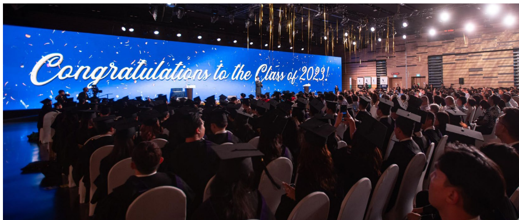
Graduates of the Class of 2023 at the Commencement Opening Ceremony.

Despite a challenging economic landscape in 2023, the Joint Autonomous Universities Graduate Employment Survey showed continued high demand for SMU's 2023 graduates, who registered healthy and stable overall employment.