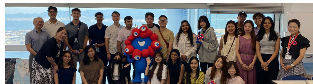
Participants in the SMU-X Overseas course in Osaka, Japan.

It was held in Osaka, Japan. Renowned as the site for the upcoming World Expo 2025 and Japan's inaugural casino resort (by 2030), the second-largest city in Japan presented a captivating backdrop for students to study global innovation dynamics.