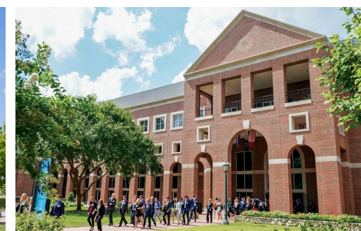
University of North Carolina at Chapel Hill