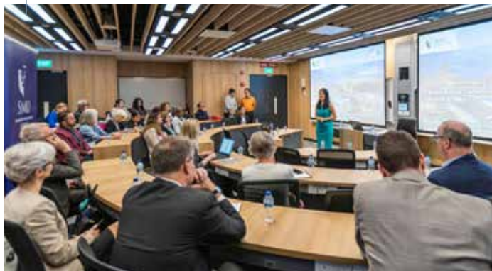
16 SMU's Overseas Centre Jakarta is located in the International Financial Centre Tower 2.